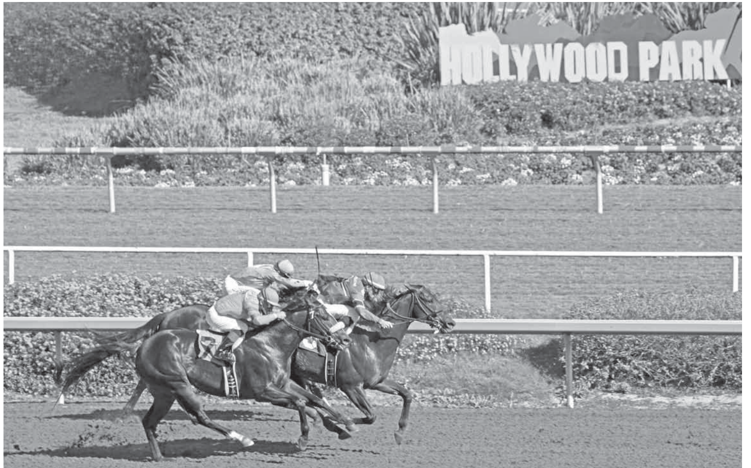
Hollywood Park closes after 75 years. Much of the track's items, including artwork and memorabilia, tractors and restaurant equipment, will be auctioned on Jan. 24-25.